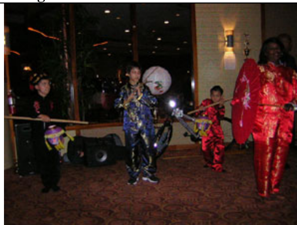
Chinese Fashion show.