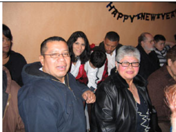
Students and family.