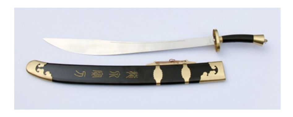
7 Star Stainless Steel Darn Gim with case (28", 30", 32", 34") - $99.00