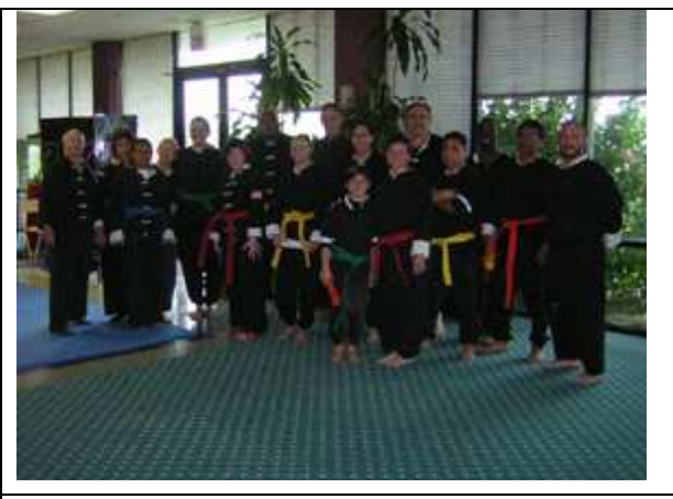
Kung Fu rank test picture on 9-8-12.