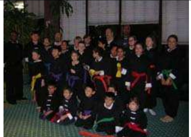
Kung Fu rank test on 12/7/13.

Black Belt club & Accelerated program rank test: