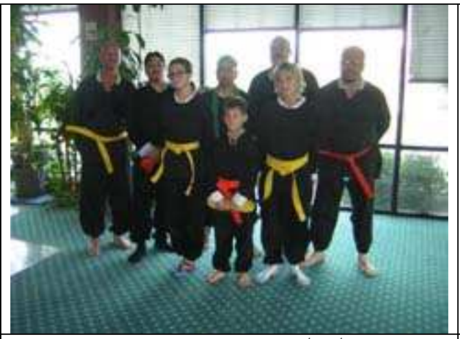
Kung Fu rank test on 11/16/13.

"Those who work their land will have abundant food, but those who chase fantasies have no sense."