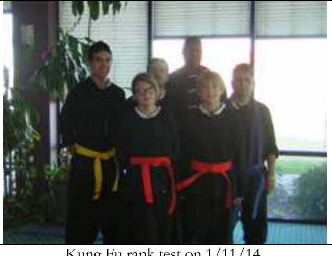
Kung Fu rank test on 1/11/14.

"Those who work their land will have abundant food, but those who chase fantasies have no sense."