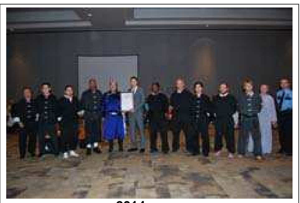
2014 12th Annual Chinese New Year & Kung Fu, Tai Chi Class Reunion Banquet - 3/8/14.

Chinese Fashion show practice date, time for New Year Banquet on 3/8/14.