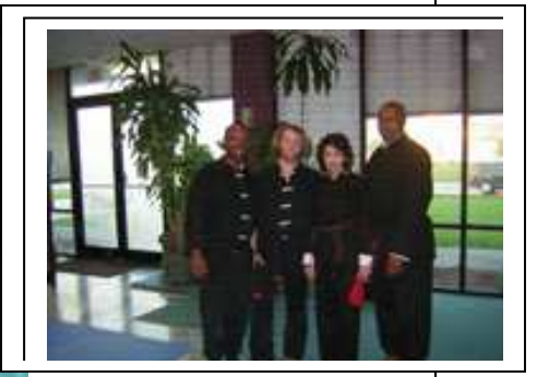
Brown & Black belt test picture - April 12, 2014.