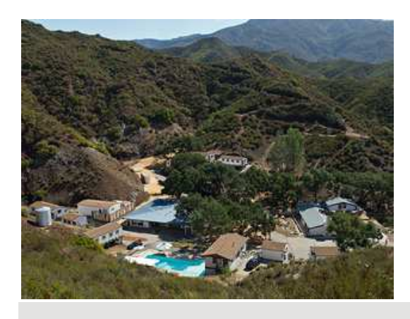
MUSE School CA

That quote comes courtesy this profile from NPR's food blog, The Salt. MUSE made the news of late when it decided to go full vegan in its school cafeteria. Within a year or two, MUSE plans to elimintate meats and dairy from the menu, as well as supply up to 50% of the plants in its plant-based diet from gardens on site. Thus the falconer. It's a private school still in search of accreditation, so these nutrition decisions come quicker and easier than most.