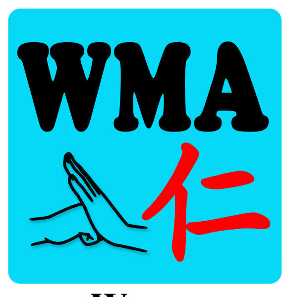
Wangs Martial Arts

App code: 2816823387 (no spaces or special characters)