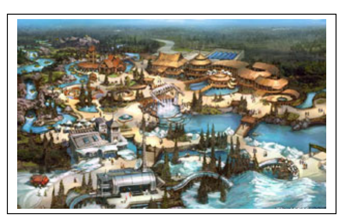
Exciting News! Earthquest Adventures The Dinosaur Theme Park is Coming Soon in New Caney, TX. Check out the latest rendering pictures of the Park, featuring a water park, roller coasters, live animals, Themed worlds, volcano & Dinosaurs of course.

For information: Call Tracy Lee (281) 682-6389 (cell) Flags Real Estate (281) 359-5881 (Office)